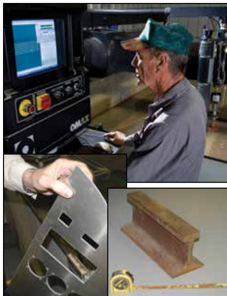
Slice right through 6-inch steel or create high-precision instrument panels with our OMAX waterjet cutter.

Our highly experienced technicians will help you bring your design to life, whether in aluminum, steel, or something more exotic. In fact, our waterjet cutter is perfect for custom marble or granite countertops or unusual signage and display projects. And waterjet cutting provides exceptionally smooth edges requiring little or no finishing.