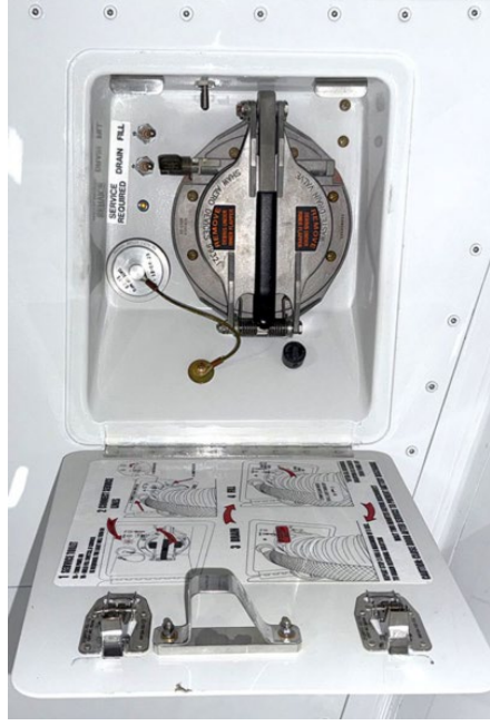
525B: Large Waste Valve Installation